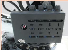
D03 Valve system provides reliable hydraulic control, indicator lights, integrated filtration, and manual overrides.