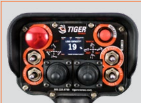
Standard wireless proportional crane and chassis control with digital crane load display.