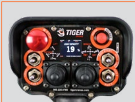
Standard wireless proportional crane and chassis control with digital crane load display.