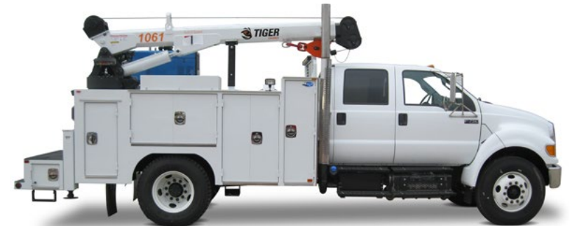
The 1061 Tiger Crane is the crane for the heavy lift user that needs big capacity in a compact package. Featuring 11,000 lbs of gross lift, 21 ft of power reach, and the ability to mount on an 11 ft crane body, the 1061 is the crane for heavy duty versatility.