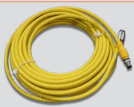
33 ft tether cord (included) allows RF-free operation or alternate power.